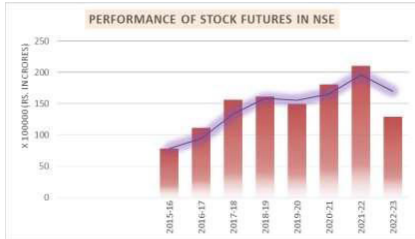
Fig 2: Performance of Stock Futures (NSE)